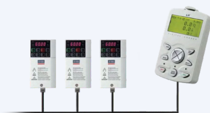
Parameters change with keypad